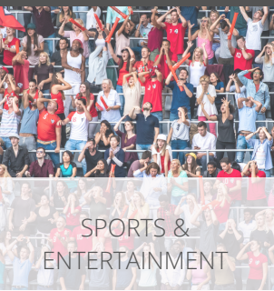
SPORTS & ENTERTAINMENT