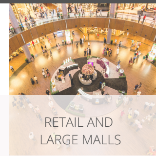
RETAIL AND LARGE MALLS