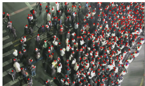
Crowd detection and people counting